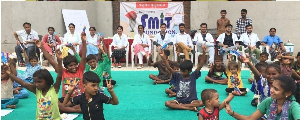
PROVIDING ORAL HEALTH EDUCATION TO CHILDREN USING MODELS