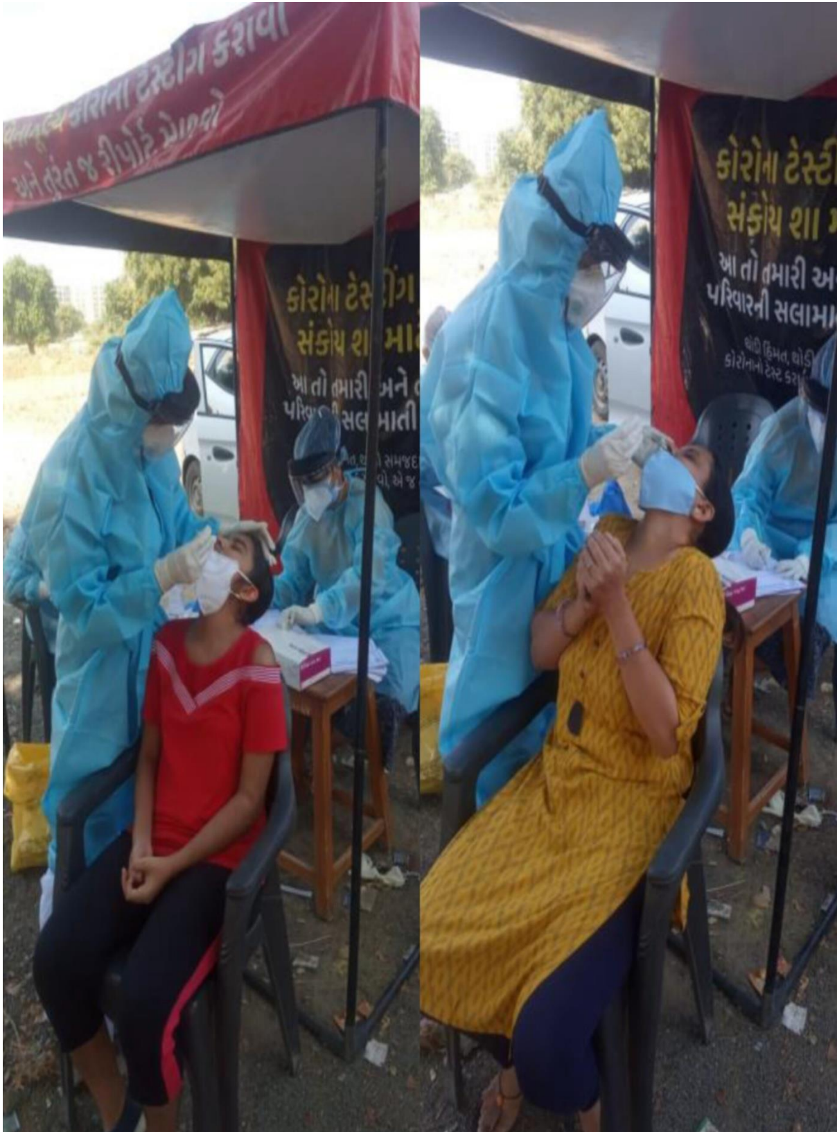
TESTING USING COVID ANTIGEN KIT