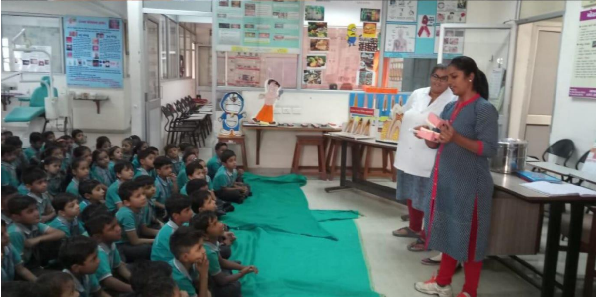
ORAL HEALTH EDUCATION