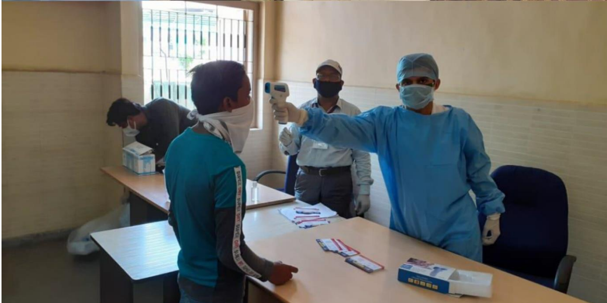
TEMPERATURE SCREENING AND DISTRIBUTION OF HEALTH CARD FOR VENDORS