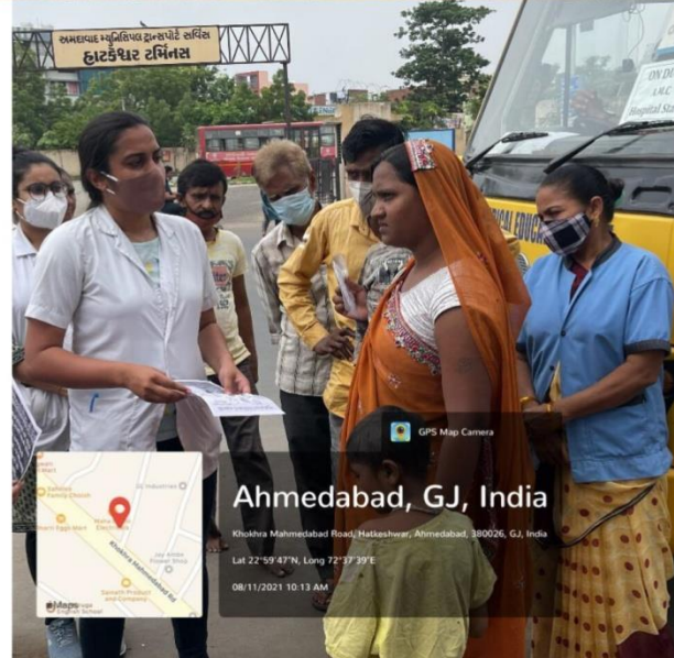
ORAL HEALTH EDUCATION BY DISTRIBUTION OF PAMPHLETS