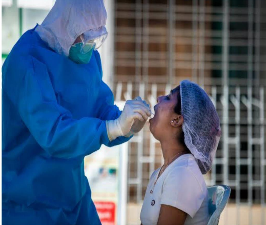
SAMPLE COLLECTION FOR ANTIGEN TESTING SANJEEVANI DUTY