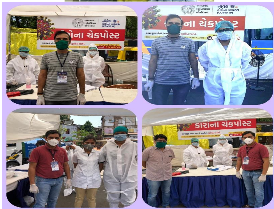
CORONA CHECKPOST DUTY WITH MEASUREMENT OF VITALS AND MEDICINE DISTRIBUTION