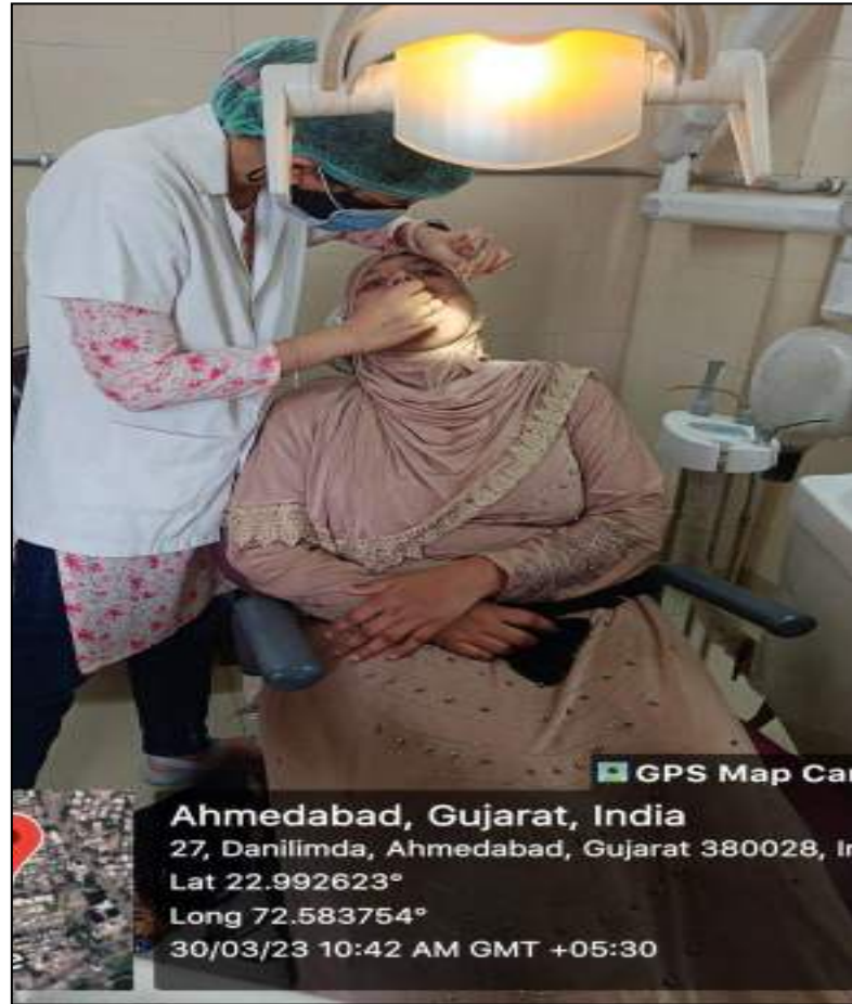
Satellite Centre (Danilimda): CHC located at a distance of 5 km from AMC Dental College, comprising of 1 dental chair.