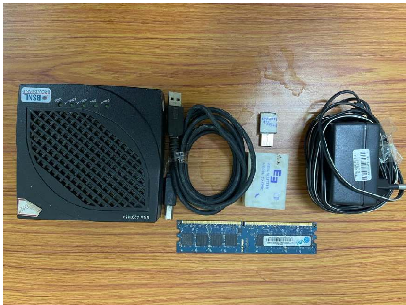
E WASTE COLLECTION (PARTS OF COMPUTER, INTERNET CONNECTION DEVICES) FROM COLLEGE