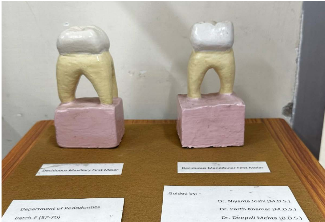
Model work given to slow learner students to improve clinical skill