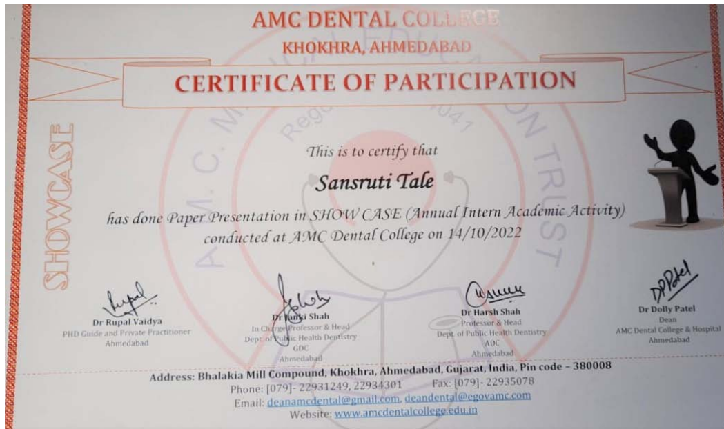
Advanced learner student performance in showcase –research work