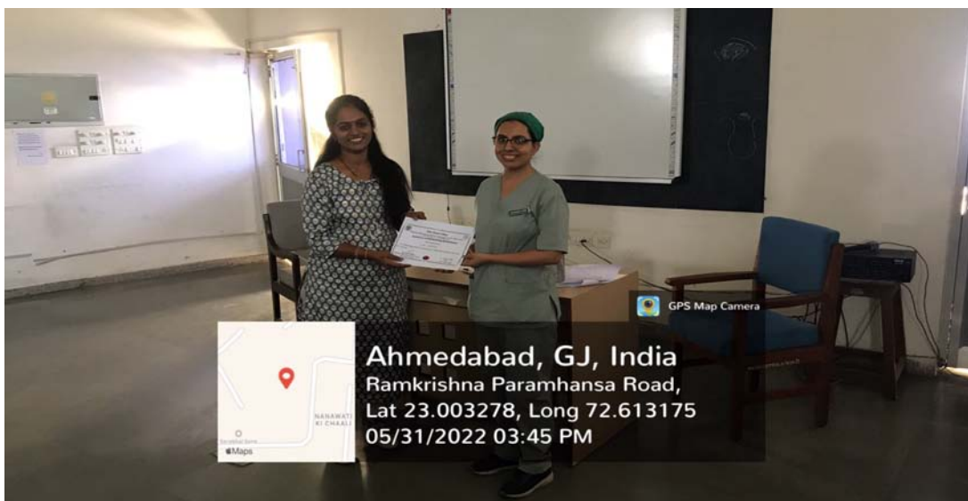
Encourage by faculty to advanced learner students for intercollege event participation