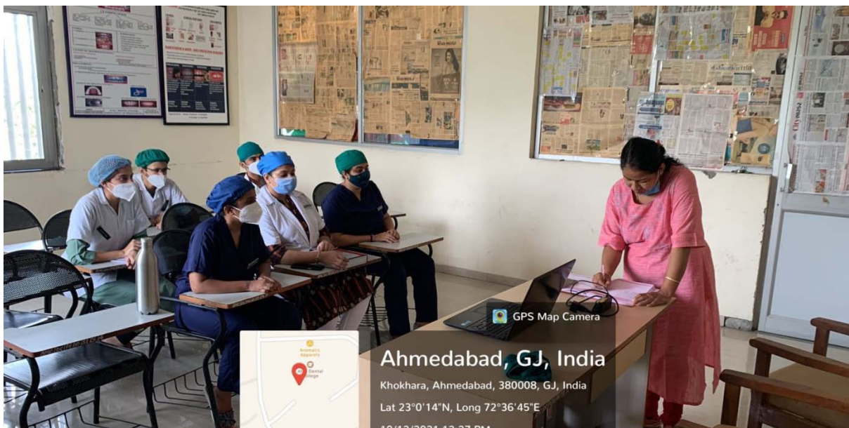
Assignment/difficulty solving session by faculty for slow learner students