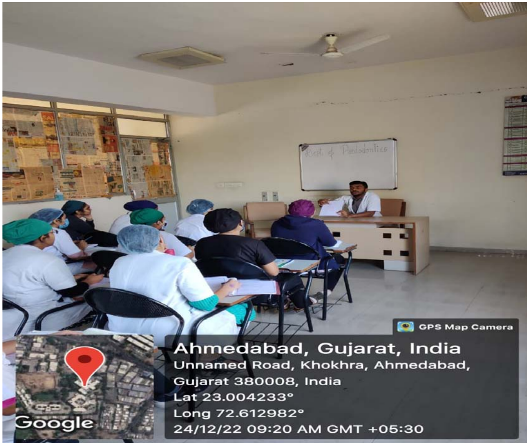
Advanced assignment presentation by advanced learner student