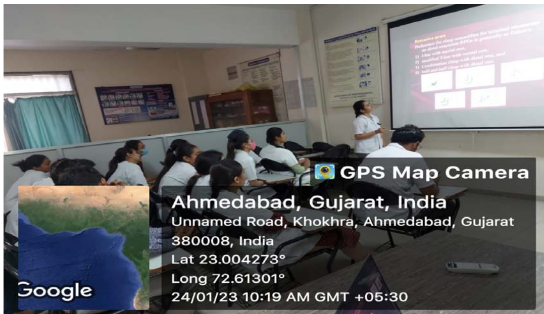
PowerPoint presentation seminar by advanced learner students