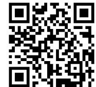
Registrar Gujarat University