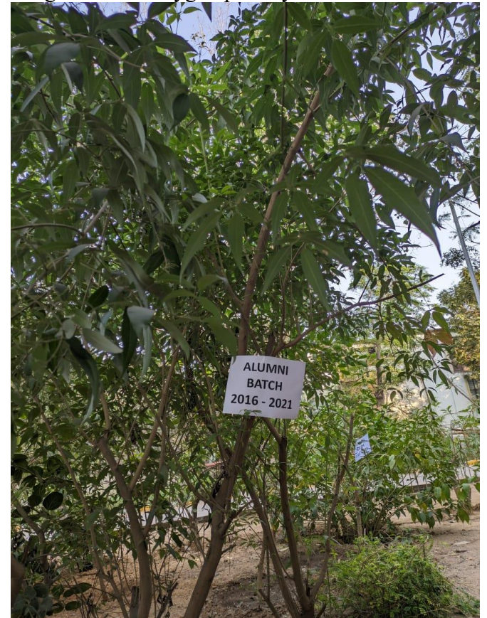
Herbal garden and oxygen park by Alumni Batch 2016- 21

Herbal garden and oxygen park by Alumni Batch 2015- 20