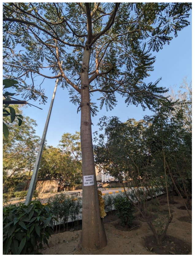
Herbal garden and oxygen park by Alumni Batch 2014- 19