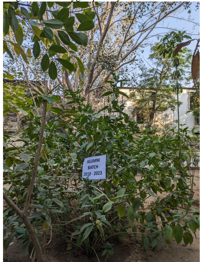
Herbal garden and oxygen park by Alumni Batch 2018-23

Herbal garden and oxygen park by Alumni Batch 2017- 22