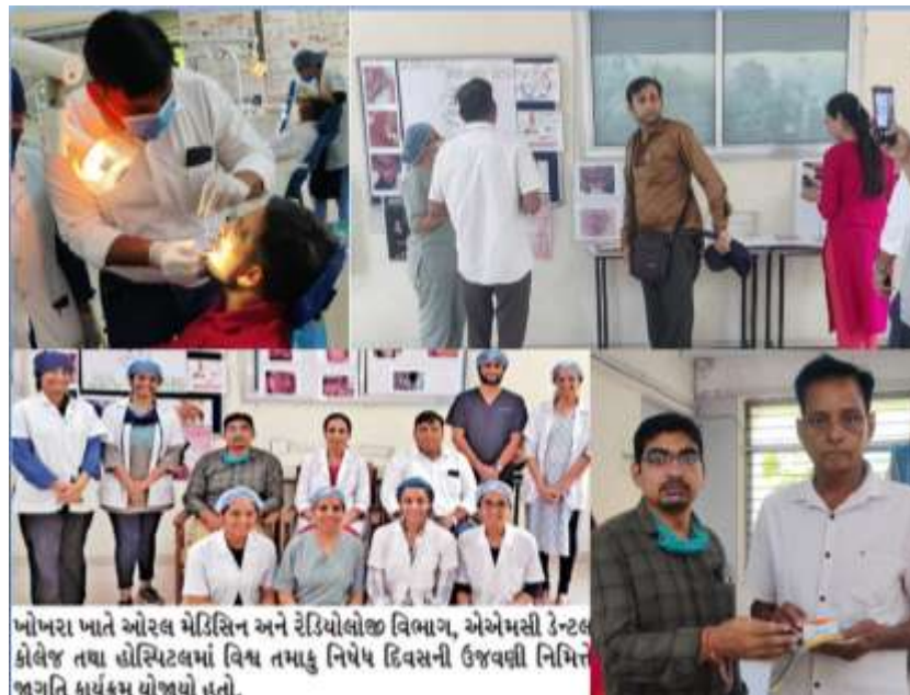
Appreciation of “awareness and screening program” conducted at the oral medicine and radiology department of AMC dental college and hospital on “World No Tobacco Day”