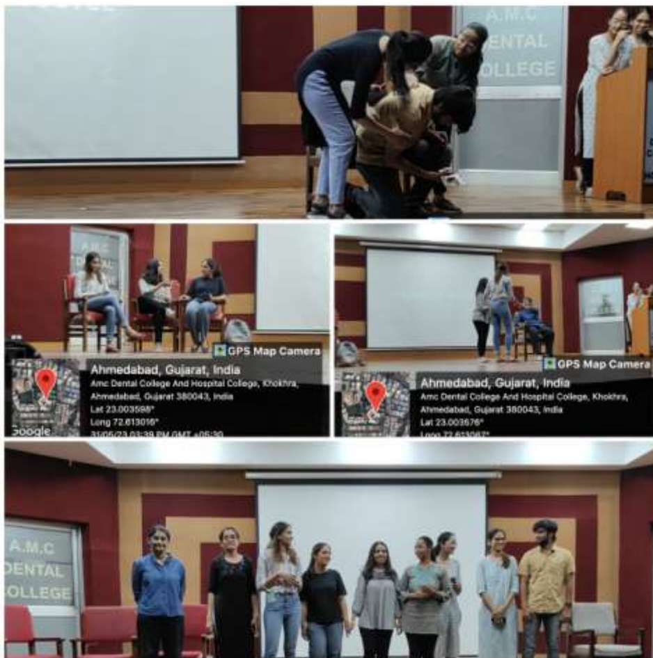
Awareness skit performed by the intern doctors to address the triggers/ risk factors of addiction in youth